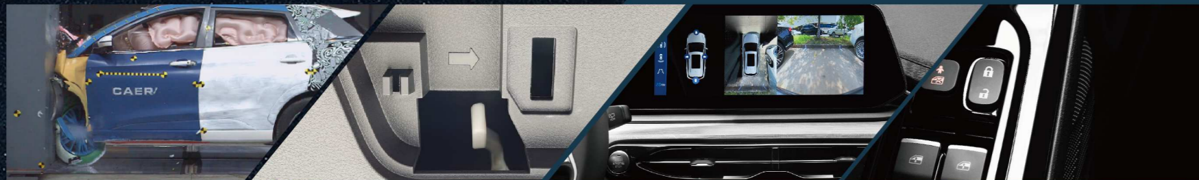
6 Airbags + "Five Star" in C-NCAP Crash Test